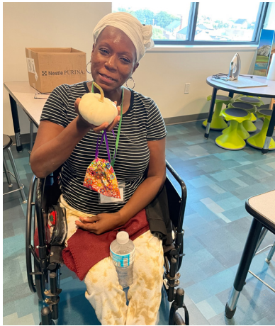
Therapeutic Art see page 2 for more