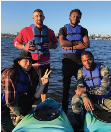
Sunset Canoe Trip see page 2 for more