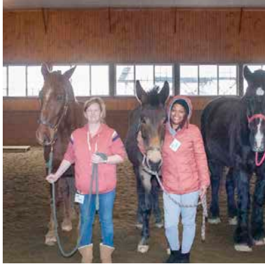
Nurturing Nature see page 2 for more